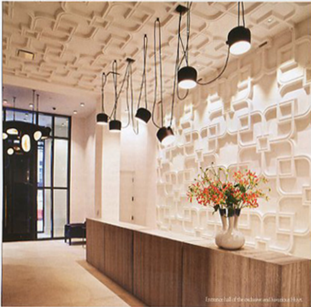
Entrance hall of the outdoor and indoor Huys.

PB-Huys was definitely a milestone when it comes to our work in New York, since Huys we were able to add two other major residential development projects to our portfolio: Coosten in Williamsburg and 101 WALL on Wall Street. For Huys, like with every other project, we studied amongst others the local vernacular, history, and the way people lived in it. By doing so we were able to really integrate our design. New York of course is such a great city. Its rich (Dutch) history and cultural influences make it the energetic city that it is.